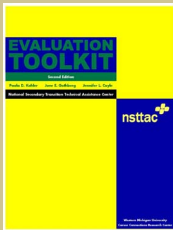
NSTTAC Evaluation Toolkit

Source: National Secondary Transition Technical Assistance Center. (2012). Evaluation Toolkit (2nd ed.). Available at www.nsttac.org