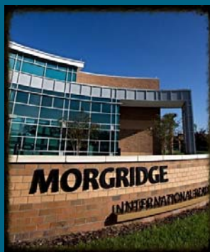
Morgridge International Reading Center at the University of Central Florida (UCF)