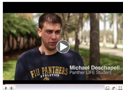
Two students in FIU's Panther LIFE share their college experiences.

is a certificate, non-degree program of study which allows students with Intellectual Disabilities to access and participate in a variety of FIU courses, varied job shadowing opportunities throughout campus, supervised employment internship experiences in the community, and other required program and community activities through a system of supports from academic mentors, peer coaches, faculty, and project personnel. Project Panther LIFE is a continued partnership between FIU, Miami-Dade County Public Schools (M-DCPS) and Parent to Parent of Miami (P to P), Inc.